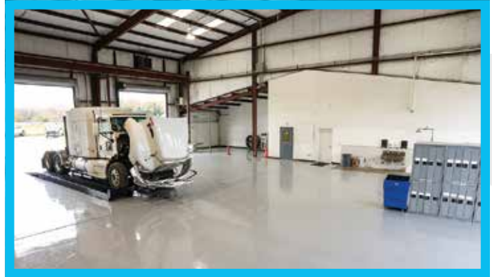
LSP Transport Maintenance Garage

For over 20 years, LSPI has partnered with Sentinel Transportation to deliver flow improver products to our customers and distribution facilities in North America. Sentinel was created in the 1980's as a joint venture between Conoco and DuPont and provided dedicated trucking and logistics management services for the two companies. Sentinel had proven track record for reliability and cost efficiency that we did not want to lose after our move to Berkshire Hathaway.