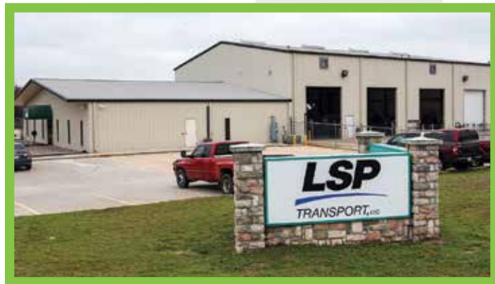
New Headquarters for LSP Transport

Shortly after LSPI was acquired by Berkshire Hathaway, the possibility arose for LSPI to assume all Sentinel people, assets and facilities that were dedicated to the business. LSPI wanted to build on the positive aspects of this relationship and integrate them into our new company. By January 1, 2015 the team of Sentinel drivers and logistics coordinators were transferred to a wholly owned subsidiary of LSPI. This new entity called LSP Transport LLC, is 100% dedicated to supporting the flow improver business.